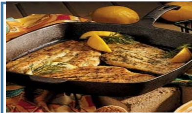
Tina Bishop's Sole in Herb Butter Sauce