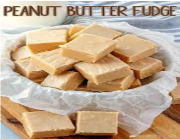
PEANUT BUTTER FUDGE BY ESTHER LARSON