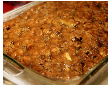
APPLE CAKE BY MYRTLE BUCKLEY