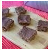
Fudge Meltaways, by Dorothy Andrews As found in Feast of Goodness Cookbook

Melt butter and cook onions until transparent. Add 1 cup cold water and remove from heat. Break up meat with a fork and add to onions. Cook until meat changes color. Boil 10 minutes. Add bread crumbs, cinnamon and cloves. Cook until liquid is absorbed. Place in uncooked pie shells. Top with crusts. Bake at 400 degrees until golden brown for approximately 35 minutes.