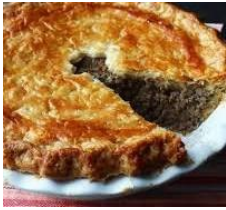
French Pork Pies, By Karen Hocking As found in Feast of Goodness Cookbook

10 T. butter 4 lg. onions chopped 3/4 lb. ground pork 3/4 lb. ground beef Salt & Pepper to taste 1 c. bread crumbs (may add more if desired) 3/4 tsp. cinnamon 3/4 tsp. ground cloves