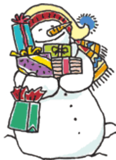
Gifts for the Staff