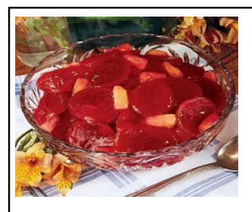
Harvard Beets with Pineapple by, Eleanor Schultz