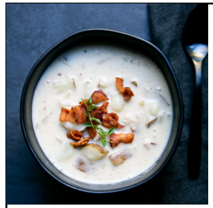
Clam Chowder by, Debbie Lang

Cook first six ingredients until thickened and shiny. Add beets ad continue to cook until beets are heated through. A nice change from the norm.