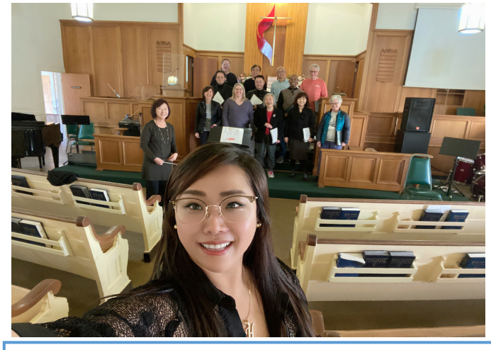
Dear Asbury Church Choir Members and Music Enthusiasts

We are excited to bring you the latest news and updates from our beloved Asbury Church Choir! Our dedicated choir has been working tirelessly since February to share the gift of song, and we were thrilled to reunite and glorify God again during last week's worship service. Here's what's happening in the choir this month: